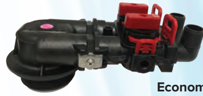
90° 3/4" NPT Elbows

Economical non-back-washing distribution head with convenient quick connect fittings